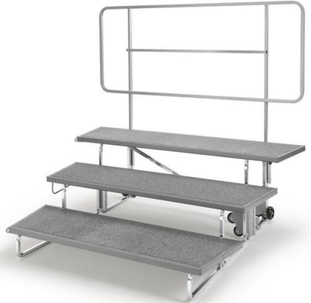
Shown with optional backrail